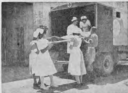
Arriving in an army ambulance of the Hadassah Hospital is this military casualty, one of the countless cases received during the war.

T.B. Hospital to care for refugee victims of dread White Plague—Plans preventative measures to maintain high health standards by X-Raying entire population of Palestine through mobile X-Ray units and laboratory units.