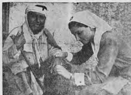
Hadassah's medical services have helped Arabs in large numbers. Here is an Arab patient receiving care from a Hadassah nurse.