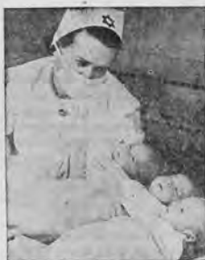
Keeping infants healthy and preventing the spread of disease among children is one of Hadassah's post-war preventive plans.