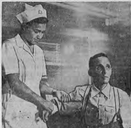
Refugees who have recently come to Palestine show a high percentage of T.B. infection. This refugee, afflicted with tuberculosis, is receiving treatment at the Hospital.

with 450 beds and largest research laboratories in the Middle East—served the United Nations during the war! Its new 250-bed Tuberculosis Hospital will serve Humanity during the Peace!